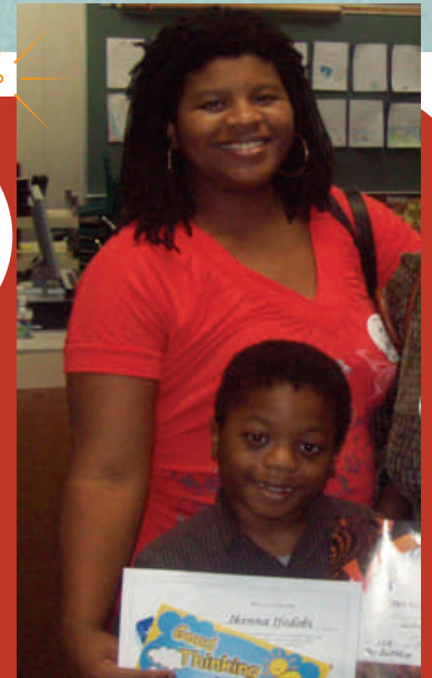
(Ziggy, and Iffy)

EJ's Neighborhood Pizzeria 12312 Barker Cypress Road #1000 Cypress, Texas 77429 (281) 373-1500